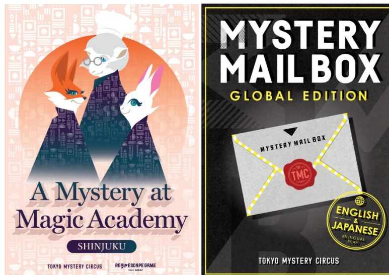
※"A Mystery at Magic Academy" "MYSTERY MAIL BOX GLOBAL EDITION" Key visuals

"MYSTERY MAIL BOX GLOBAL EDITION" and English merchandise will be available from 15 th March 2018, "A Mystery at Magic Academy SHINJUKU" will be available from 20 th March 2018.